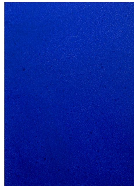
Skoya Assemat-Tessandier, L'Abysses, acrylic on canvas (wooden stretchers), 150cm x 110cm, 2016