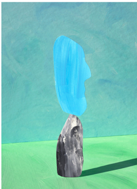
Ina Jang "blue three", 2018 (Framed) 61 × 50 cm

Artistes a Swab: Artistas en Swab: Artists at Swab: Ina Jang